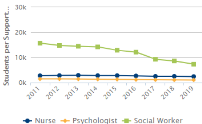
Ratio of Students to Pupil Support Service Personnel California

Definition: Ratio of public school students to full-time equivalent (FTE) pupil support service personnel, by type of personnel (e.g., in 2019, there were 2,410 students for every FTE nurse serving California public schools). Smaller numbers indicate that students have greater access to support service personnel.